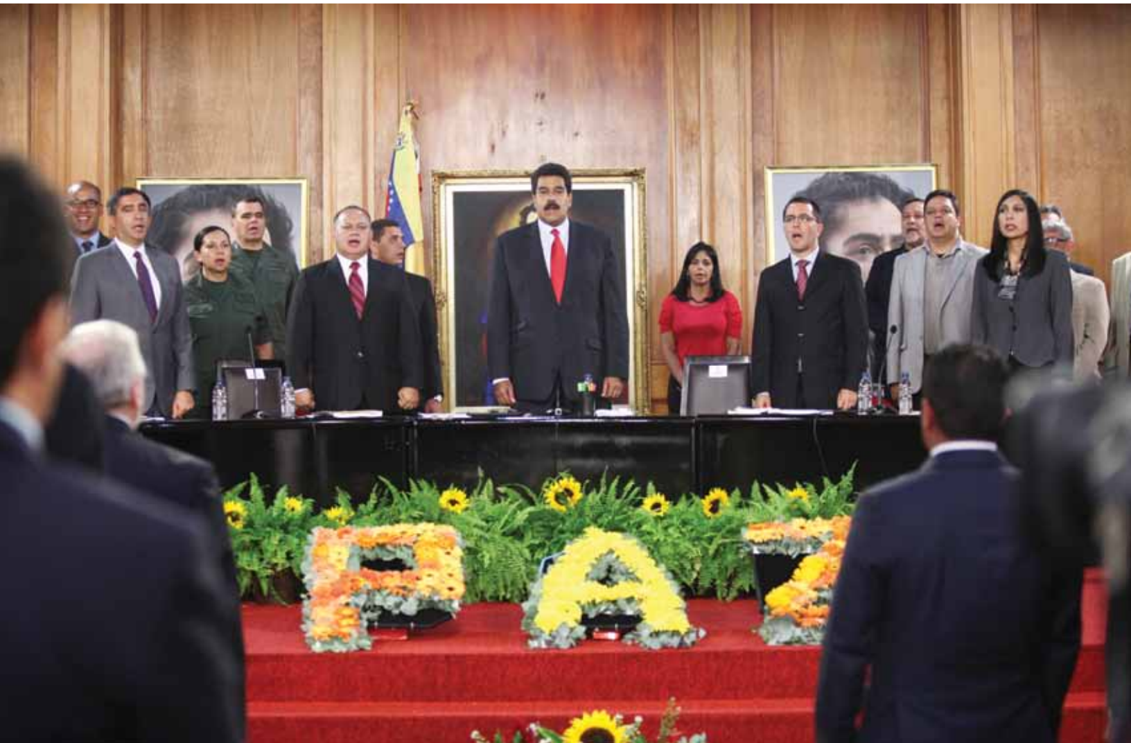
A torture complaint in Spain is turned into a Venezuelan case by the psychological war laboratories

With this declaration, the OEA condemn the violence and dismisses the possibility to intervene in Venezuela inner businesses.