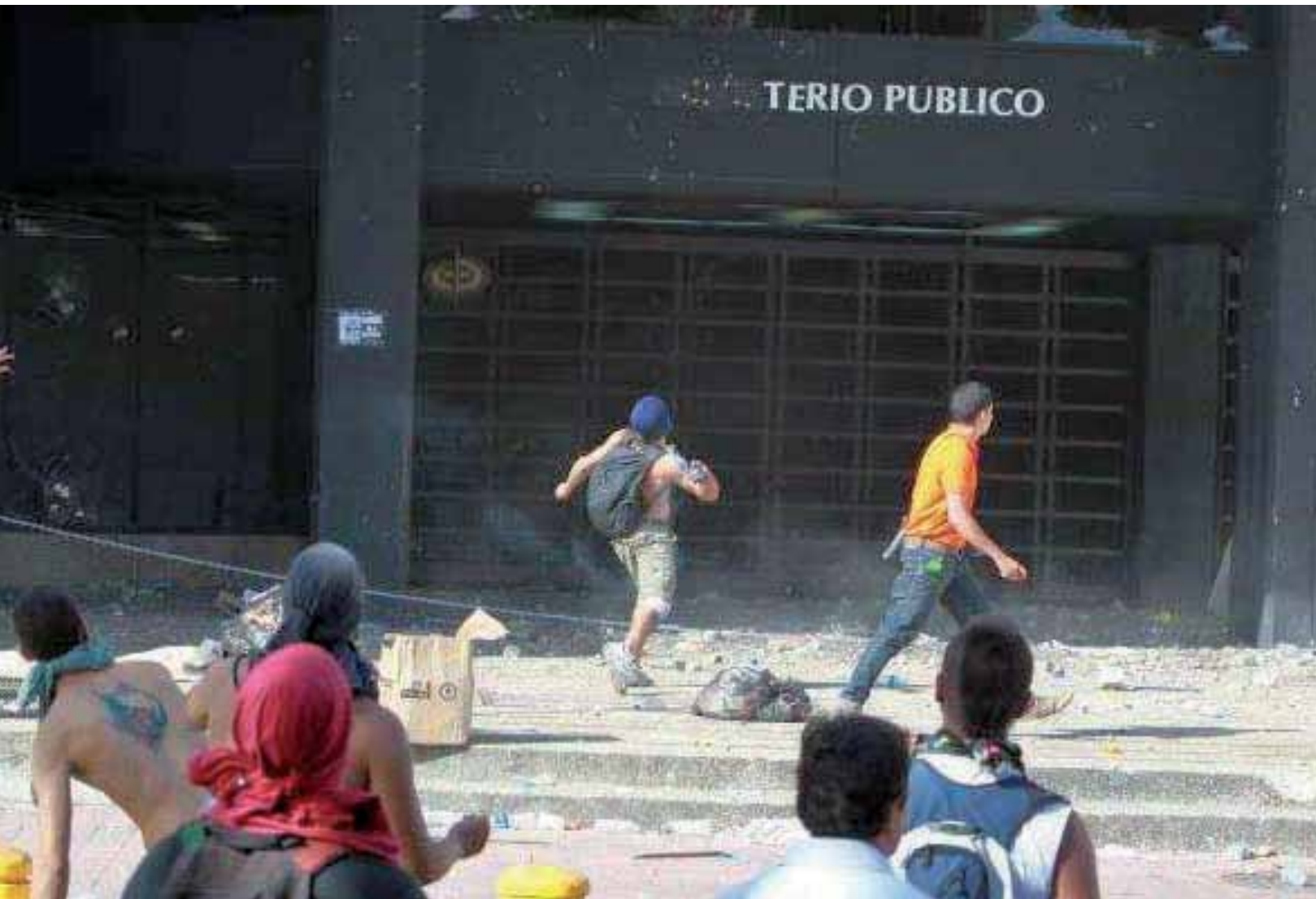
Attacks to the Headquarters of the Public Ministry in Caracas on February 12, 2014.