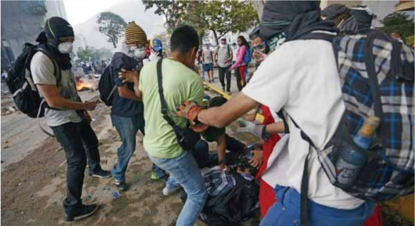
A journalist is injured by a violent group in a municipality whose mayor is oppositor.