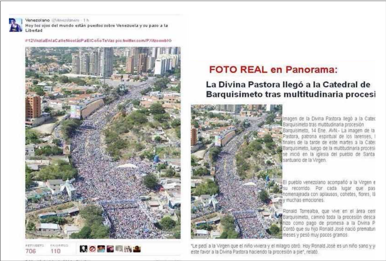
A religious manifestation in the city of Barquisimeto is falsely presented as a protest against the Government.

and its workers have been attacked. Transport units, radio bases, wiring, and telephone centrals were attacked with bombs and gunshots to damage the Internet service, blaming this way the Government of a supposed “censorship.”