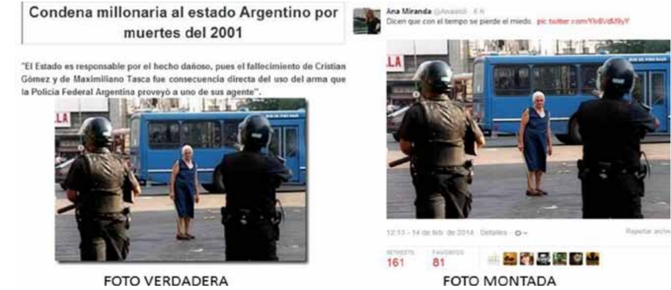
An event that took place in Argentina in 2001 was published in the social networks as if it recently took place in Venezuela.