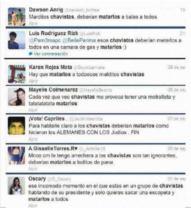
Part of the psychological war took some people to express hate messages in social networking.