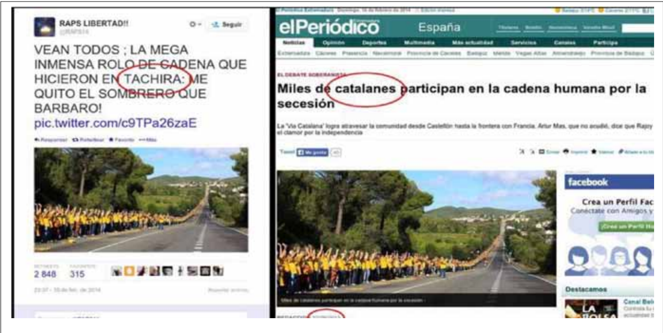
It is pursued to make believe that a protest takes place in Táchira state, when it actually takes place in Spain.