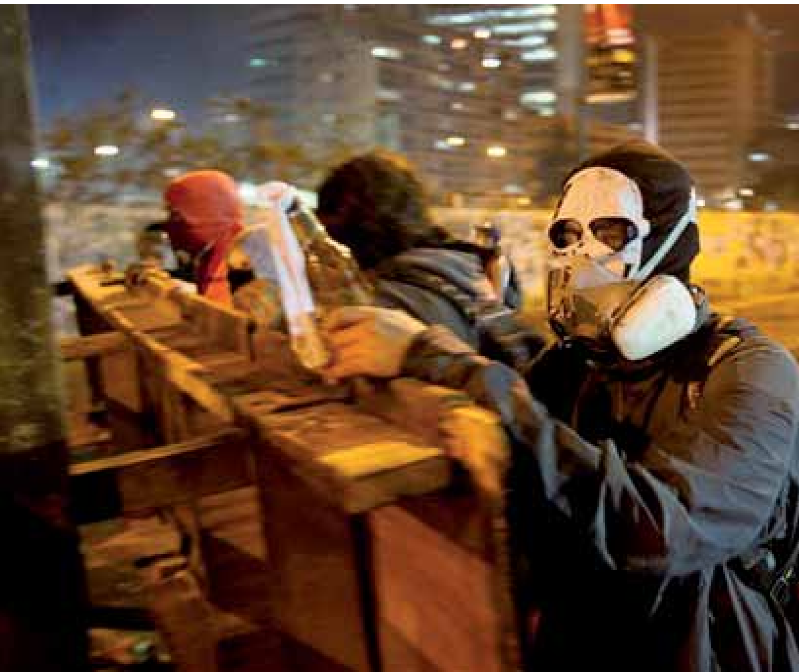
The guarimbero follows the pattern of a terrorist: anyone who uses force or violence, menace or terror to carry out a criminal project, whether individually or collectively.