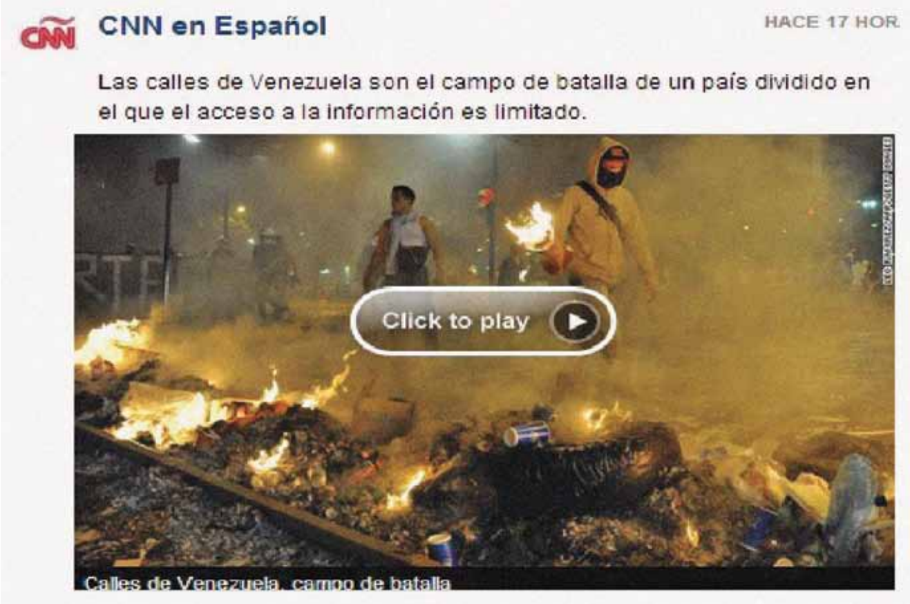
This is how CCN en Español presents its information on Venezuela.