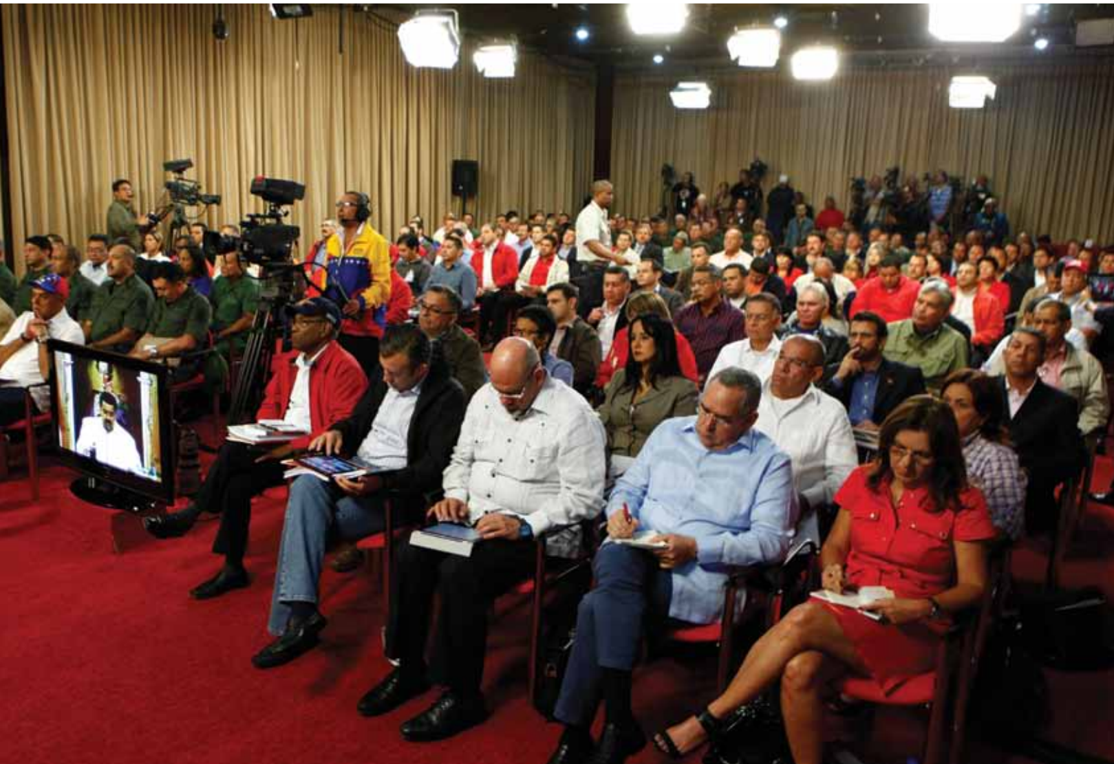
Second meeting held by President Maduro with the mayors and states’ governors both of opposition and revolutionary parties on January 8, 2014 in Miraflores, Caracas.

Despite categorizations, the practice of guarimbas uses young people as a key tool of terrorist violence by manipulating their emotions,