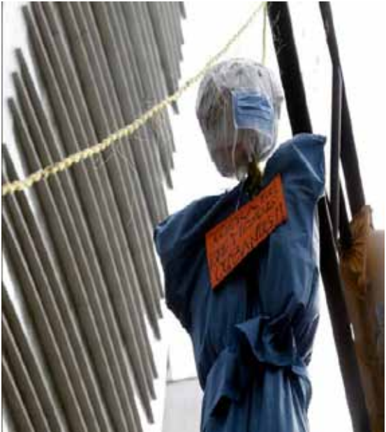
Death menaces were seen in some of the municipalities controlled by the right wing.