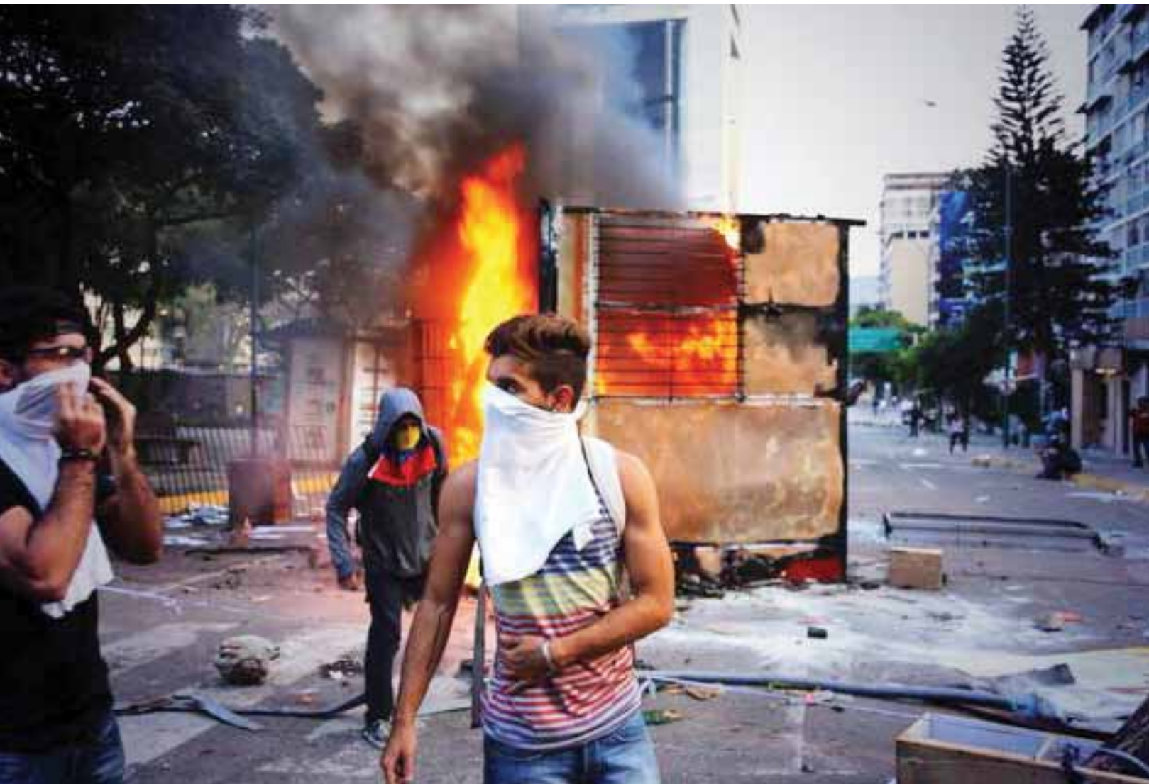
They destroyed and burned a service hut of superficial transportation – Metrobús – in the municipality of Chacao, Miranda.

case of failure, the pressure on the streets is maintained and armed resistance is assumed, preparing the stage for a military intervention or a prolonged civil war.