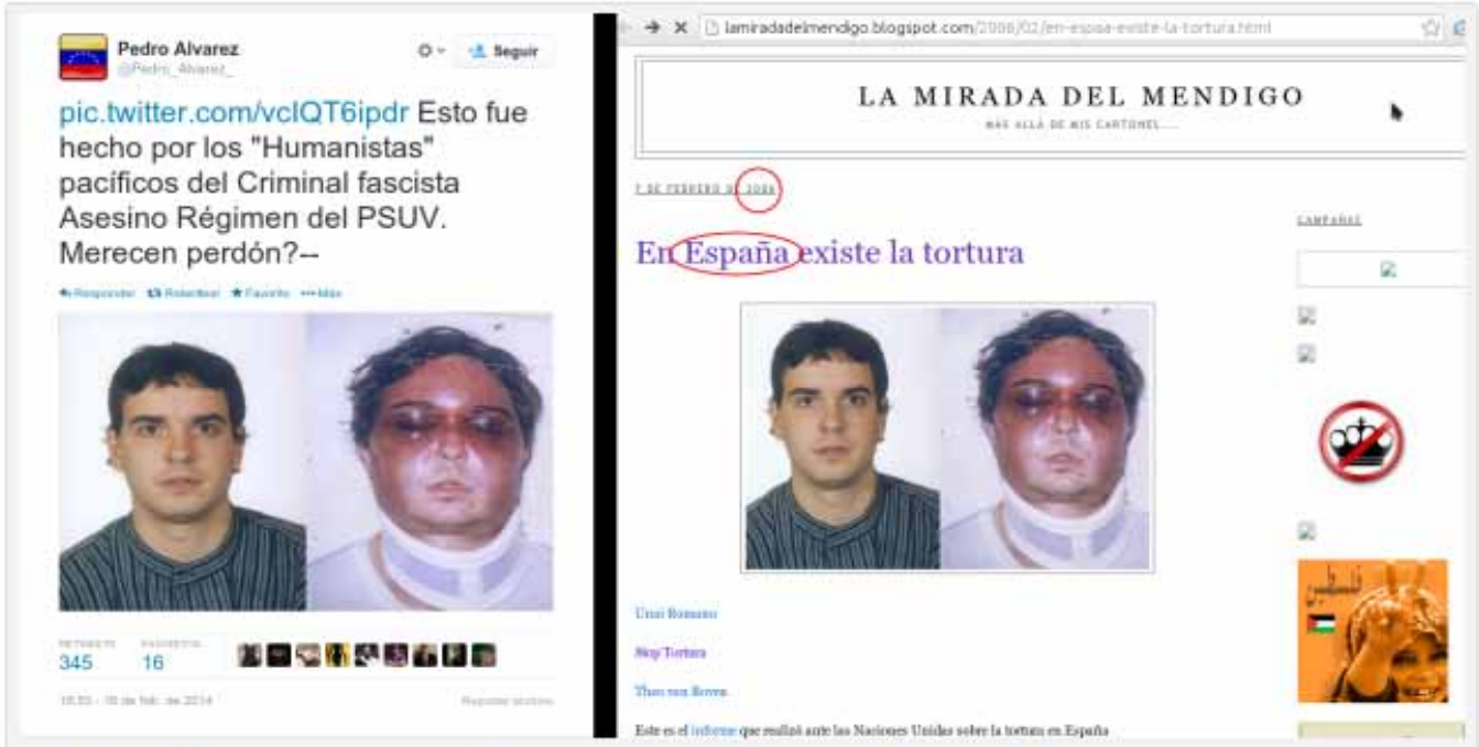
A torture complaint in Spain is turned into a Venezuelan case by the psychological war laboratories.