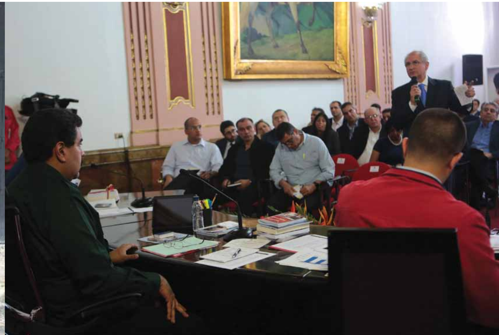
Session of the Government's Federal Council in Miraflores on December 18, 2014, called by President Nicolás Maduro; Governors and mayors of both revolutionary and right-winged parties attended.