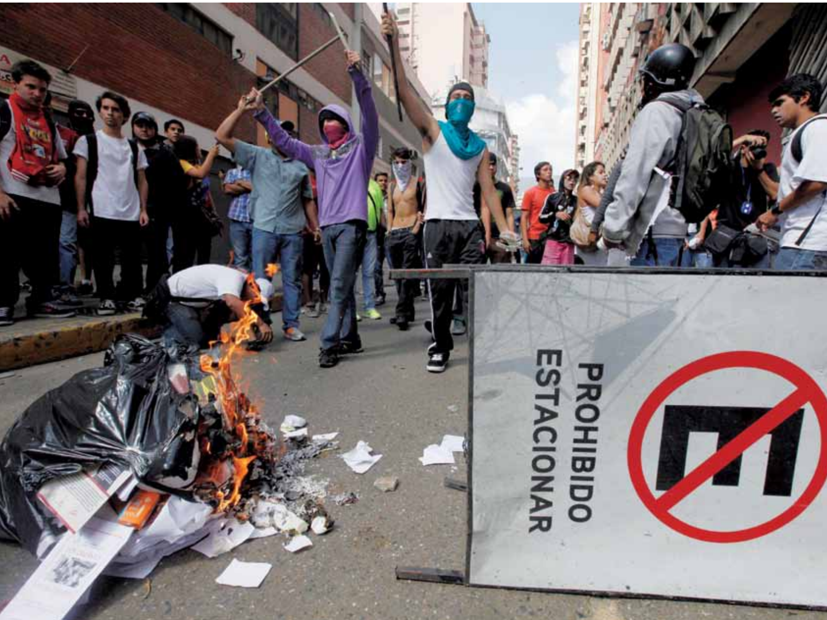
The loutish actions spread all over the country after the call to go on the streets made by Leopoldo López and María Corina.

the insurrectional plan against the democratic government of Venezuela that takes place nowadays and began with his call to remain on the streets until President Nicolás Maduro is overthrown. “Venezuelans are forced to demand the exit of a corrupt government.”