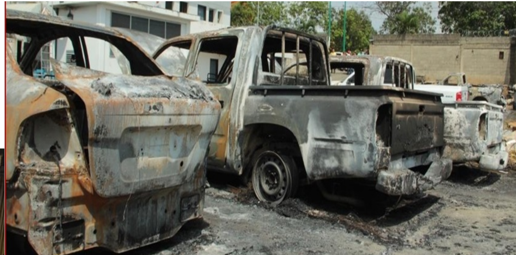
Telephone network interface boxes, as well as transportation vehicles, have been burnt, putting at risk the life of workers and interrupting the service

due to the characteristic features of this age group: less patience, greatest openness to take lead and less self-control boldness.